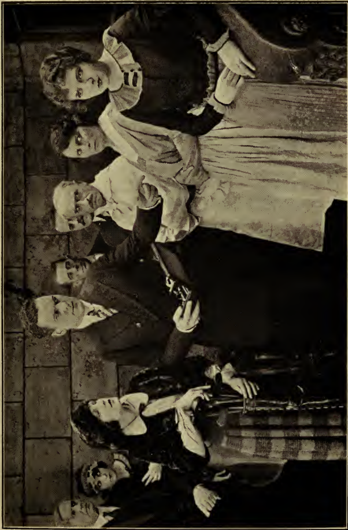
A Paramount Picture

· O'BANNON BEGINS HIS INVESTIGATION OF THE THEFT.